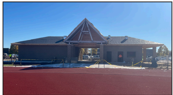
New concession stand and restrooms