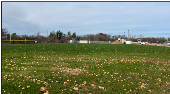
Marching band practice area