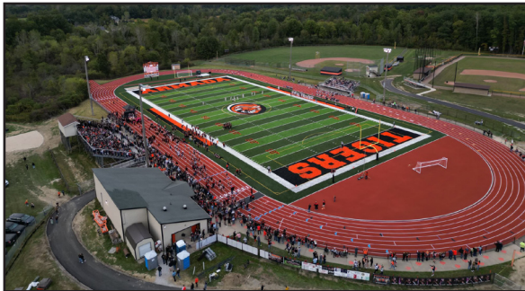
New turf football/soccer field & resurfaced track

We're excited about the improvements taking shape and look forward to seeing these projects completed in the near future!