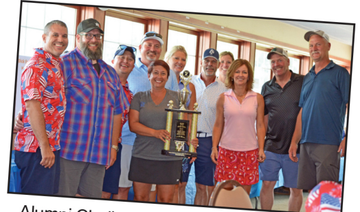
Alumni Challenge Winner: 1990s Classes