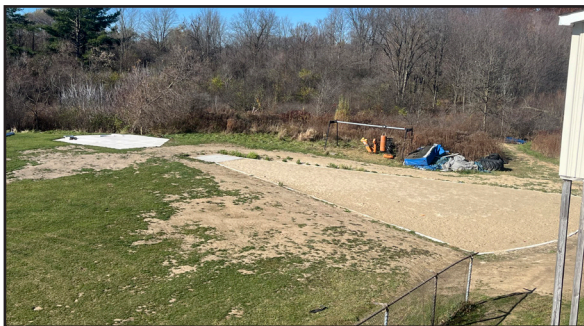
Discus and shot put pads