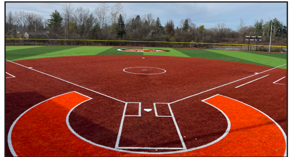
New turf softball field