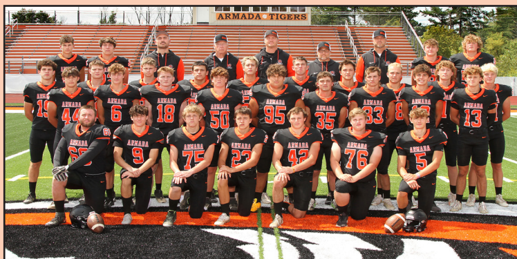
Best Armada High School football team in school history with 10-2 record. MHSAA Division 5 District Champions - First District title ever! Macomb County Football Team of the Year.