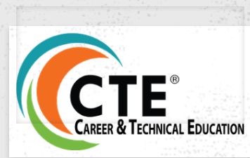
CAREER AND TECHNICAL EDUCATION